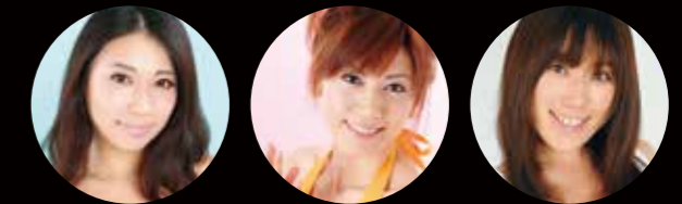
We are PLASTIC GIRLS

We look forward to seeing you at the venue.